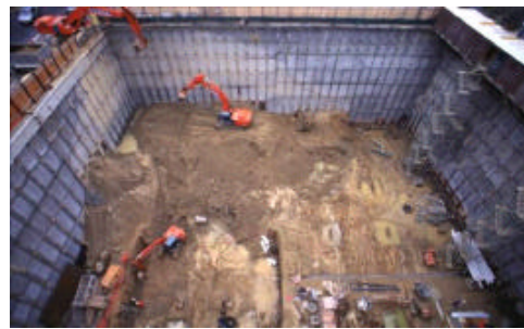
(d) Excavation reached final level