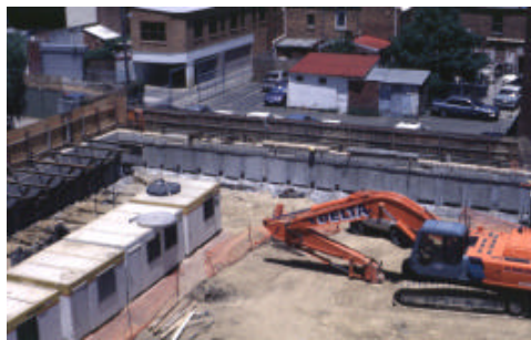
(a) Commencement of excavation

One limitation of field excursions is that students can only see a snapshot of one part of the whole construction activity that occurs on the day of the visit. The main part of the module comprises a 25-minute video in DVD format, which was filmed over a 12-month period and recorded the entire construction sequence right from the commencement of the earthworks to the completion of all basement excavation (see Figure 1).