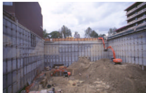
(b) Excavation in progress