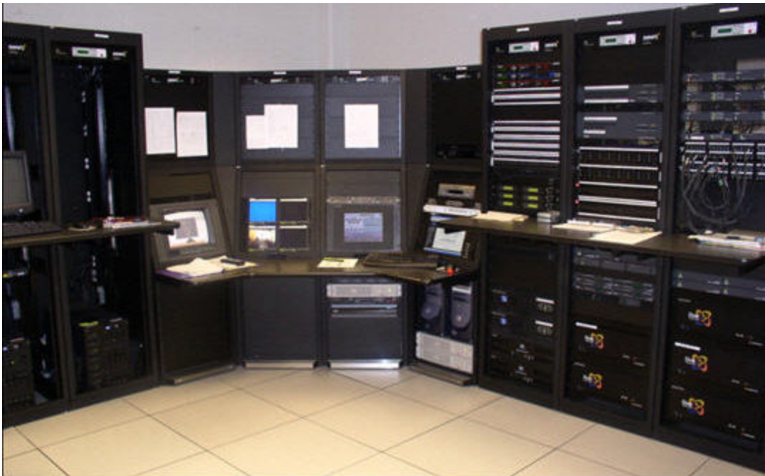
Figure 5. Global Classroom control room.

To enhance availability and adequacy of delivery tools, some units supplement the Blackboard system with extra departmental servers that are used to provide services that Blackboard system does not offer. For example, web servers may be used to provide streaming audio and video components in which faculty teach segments of course content. Others servers provide secure FTP service for students to submit their assignments, or download other supplementary materials.