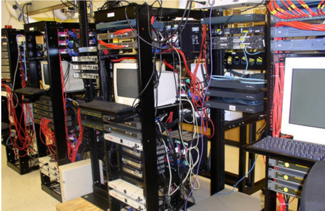
Figure 3. Operating systems and network management racks.

In the Computer Networking Management concentration, lab exercises are centered on networking infrastructure design, configuration, and troubleshooting. Naturally, the lab equipment must include switches, routers, server computers, workstation, and other network devices, such as Voice over IP devices, and Storage Area Network equipment.