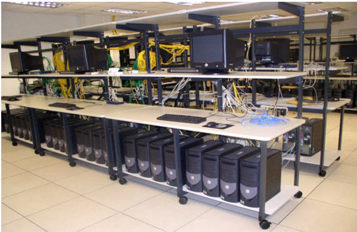
Figure 2. Digital Communications remote access lab.

In the Digital Communications concentration, lab exercises are centered on network service design, installation, and configuration. The lab equipment needs are primarily network server computers and workstations, with a few routers, switches, and remote access supporting devices. A cross section of the Digital Communications lab is shown in Figure 2.