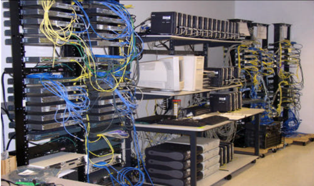
Figure 4. A cross-section of the Information Assurance laboratory.

Our faculty and staff evaluated several remote access and control packages and chose to implement RemotelyAnywhere in some of the courses. Additionally, some instructors add Microsoft Windows Remote Desktop connection due to its speed and improved security features. Both packages are implemented over secure communications channels.